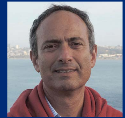
Why Regional Journalism Is on Life Support READ MORE