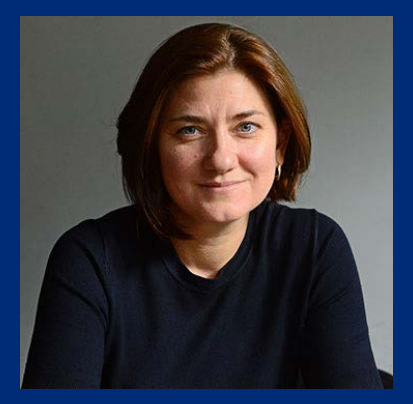
Press Ctrl+Alt+Del. Restart Bulgarian Media. READ MORE