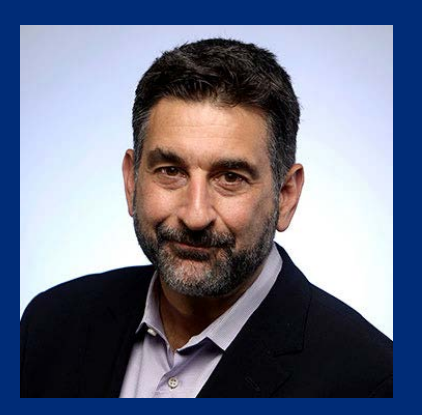
Journalists' Work Matters. So, Pay for It. READ MORE