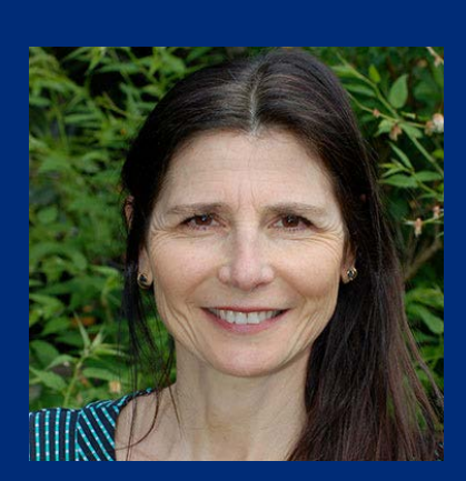
Bulgarian Investigative Reporting: Mixed News