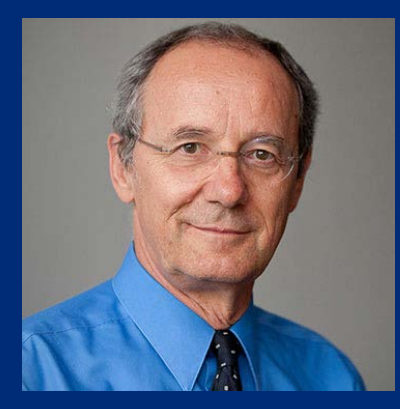
Why Radio Free Europe Is Returning to Bulgaria READ MORE